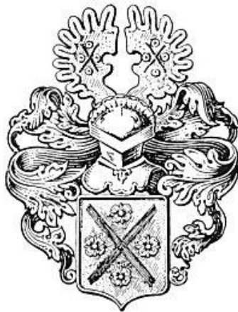
THE CREST OF JOHANN VALENTIN ANDREÆ.

Max Heindel, the Christian mystic, described the Rosicrucian Temple as an "etheric structure" located in and around the home of a European country gentleman. He believed that this invisible building would ultimately be moved to the American continent. Mr. Heindel referred to the Rosicrucian Initiates as so advanced in the science of life that "death had forgotten them."