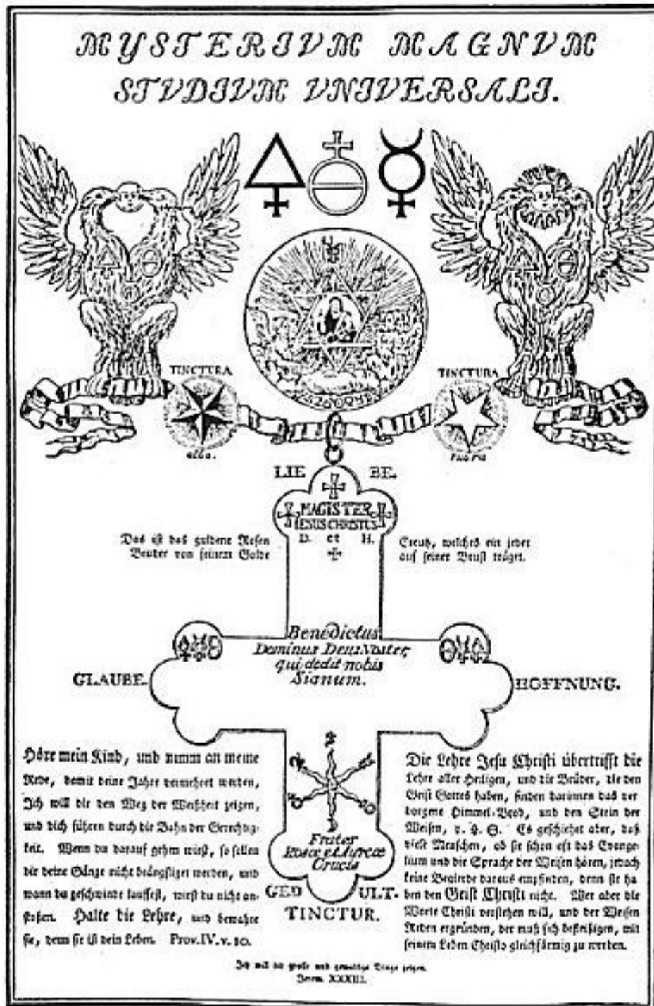
THE GOLDEN AND ROSY CROSS.

whom he bound by an oath to preserve inviolate the secrets he should impart and to write down for the sake of posterity the information